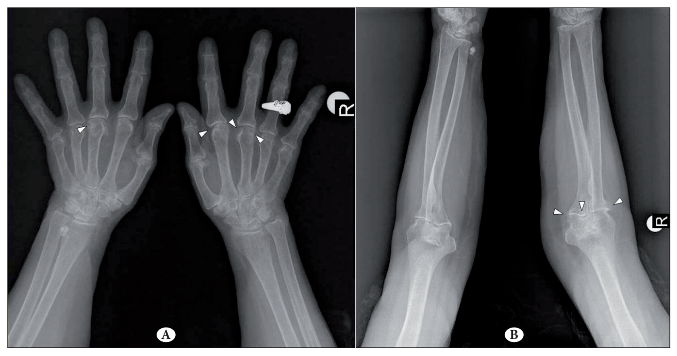
Figure 2. Radiographs showing narrowing in the 2<sup>nd</sup> and 3<sup>rd</sup> MCP joints' space, subchondral sclerosis, cysts and osteophytic changes of hand joints (A), and joint space narrowing and subchondral sclerosis in the right elbow joint and osteophytic changes in radius and ulna (B).

Hemochromatosis (HC) causing iron overload. Articular findings are seen in 25–50% of patients with HC. It typically affects the 2<sup>nd</sup> and 3<sup>rd</sup> MCP joints as articular manifestations. Knee, hip and wrist joints may also be involved (13). Hyperpigmentation, hepatomegaly, diabetes mellitus, abnormal liver function tests can be