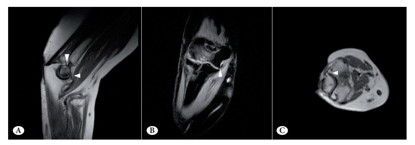
Figure 3. Magnetic resonance imaging illustrating degenerative changes on T1-weighted coronal (A), T2 weighted (fat suppressed) sagittal (B) and T1 weighted axial (C) views.