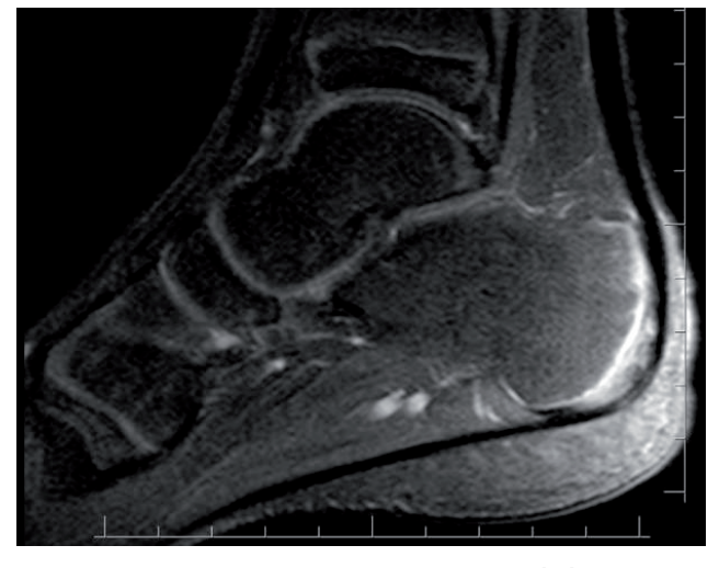
Figure 2. Magnetic resonance imaging reveals bone injury and microfractures in the calcaneal apophysis and the apophyseal joint.