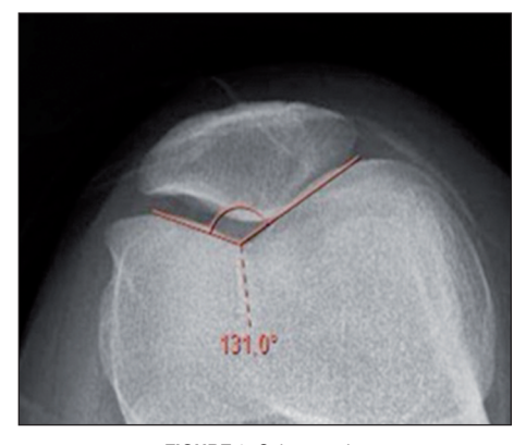
FIGURE 2: Sulcus angle.

Chi-Square Test and Fisher's Exact Test. The normal distribution of the variables was tested using visual (histograms and probability graphs) and analytic (Kolmogorov Smirnov/Shapiro-Wilk Tests) methods, and not all continuous variables were found to conform to normal distribution. The statistical significance of the difference between two independent groups was analyzed with Mann Whitney U Test. The association between variables was evaluated using Spearman's Test. The level of statistical significance was set as p<0.05.