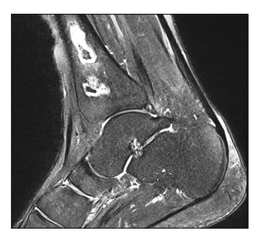
FIGURE 3: T2- weighted left ankle magnetic resonance image showed geographic areas of increased signal intensity within the medullar cavity of the left distal tibia, consistent with osteonecrosis.