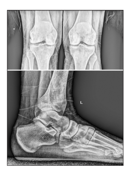
FIGURE 1: Plain bilateral knee and left ankle radiographs.

AVN of the bone is one of the leading causes of morbidity and disability in SLE patients.<sup>2</sup> AVN has been reported in 2-30% of patients with SLE.<sup>8</sup> Osteonecrosis (ON), is the cellular death of bone compo-