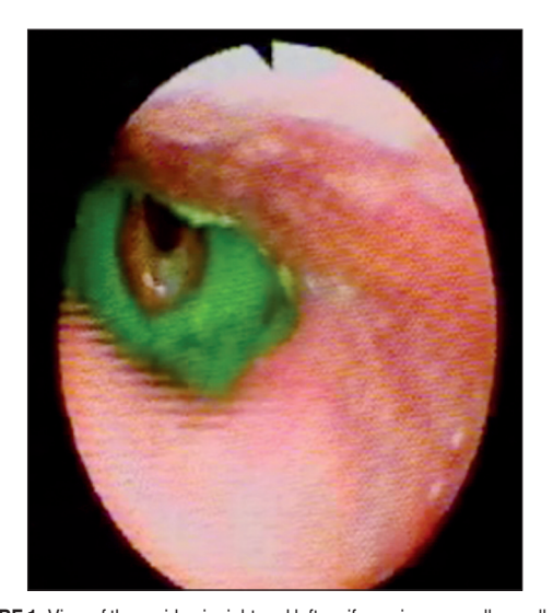
FIGURE 1: View of the residue in right and left pyriform sinus as well as vallecula, and laryngeal penetration with semi-solid food by using endoscopy. Arrow: laryngeal penetration; Asterisk: residue.

Drug-induced parkinsonism (DIP) is the second most common cause of parkinsonism after Parkinson's disease.<sup>6,7,10</sup> Drug-induced parkinsonism is related to drug-induced changes in the basal ganglia motor circuit secondary to dopaminergic receptor blockade that are widely distributed in the brain.<sup>11</sup>