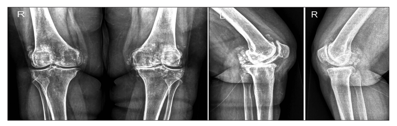
FIGURE 1: Postero-anterior and lateral X-rays of the knees demostrating bilateral widespread multiple calcified loose bodies, joint space narrowing and osteoporosis.

Radiographs of the hand and knees and magnetic resonance imaging (MRI) examination of both knees were performed. In consistent with physical examination, bilateral hand radiographs revealed typical features of advanced RA; bilateral radiocarpal, intercarpal and carpometacarpal joint space narrowing, periarticular osteoporosis, demineralized carpal bones, erosions in carpal bones and styloid process of ulna. On the other hand, bilateral knee radiographs showed widespread multiple calcified loose bodies, joint space narrowing and osteoporosis as shown in Figure 1. Moreover on bilateral knee