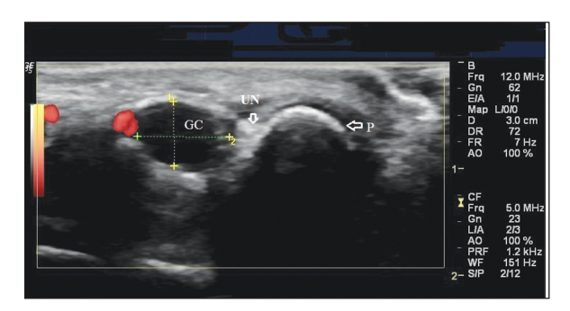
FIGURE 1: Ultrasonographic image of cyst before aspiration. GC: Ganglion cyst; UN: Ulnar nerve; P: Pisiform bone.

Cevriye MÜLKOĞLU et al. J PMR Sci. 2021;24(3):304-7