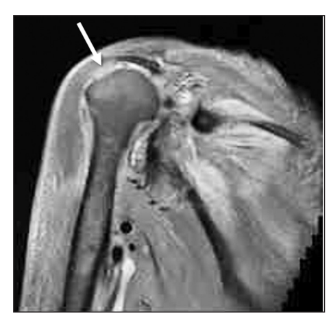
FIGURE 3: MRI of the left shoulder-coronal PD FSE Fat Sat Sequence. The arrow indicates the absence of supraspinatus tendon at the insertion site and retraction of the supraspinatus muscle to the suprascapular fossa.

MRI: Magnetic resonance imaging; PD: Proton density; FSE: Fast spin echo.