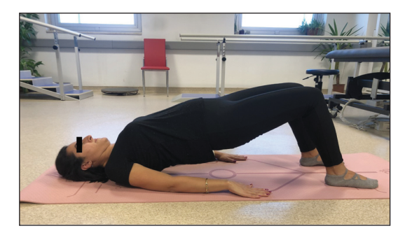
FIGURE 5: Bridging exercise.

were included in the wait list to be given a physical therapy program at the end of the study period.