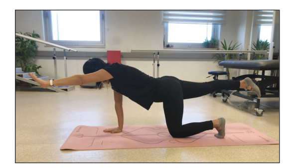
FIGURE 3: Quadruped position exercise.

(Figure 2) and quadruped position with alternate arm/leg raises (Figure 3). The prone blank (Figure 4) and bridging (Figure 5) were also added at this stage. Each exercise position was continued for 5-10 seconds and applied in 10 repeats.<sup>16</sup> Compliance of the patients with the exercise program was inquired every time they had TENS and hot-pack application in the clinic. After the end of 20 sessions, the patients continued the exercises as a home program. They were called once a week and questioned whether they implemented the home program.