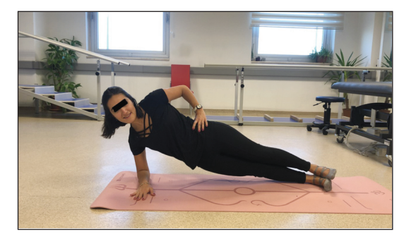
FIGURE 2: Side bridge exercise.