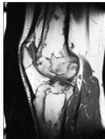
FIGURE 2: T1-weighted left knee magnetic resonance image showed geographic areas of decreased signal intensity within the medullary cavity of the left distal femur and proximal tibia, consistent with osteonecrosis.

nents due to interruption of blood supply, resulting in pain, bone destruction and loss of function or avascular necrosis of bone. 11,12 AVN in patients with SLE is most common in the femoral head, although the humeral head, tibial plateau, and scaphoid navicular can also be affected. 13 Many local and systemic factors have been implicated in the pathogenesis of AVN, involving corticosteroid therapy, systemic lupus erythematosus (SLE), hemoglobinopathies, alcohol abuse, Caisson disease, Gaucher disease, and hypercoagulability states. 1,3,9,11,14,15 Lupus activity, the presence of arthritis, vasculitis, aCL, corticosteroid and cytotoxic medication was associated with increased risk of avascular necrosis. 1,3,16 The association of AVN and aPL in patients with SLE has shown to be signif-