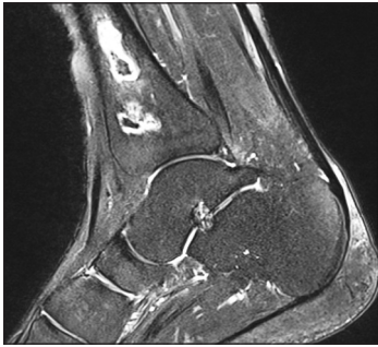
FIGURE 3: T2- weighted left ankle magnetic resonance image showed geographic areas of increased signal intensity within the medullary cavity of the left distal tibia, consistent with osteonecrosis.

icant in many studies. 14,17 However, the role of aPL in the pathogenesis of AVN is not proven yet as some studies have failed to establish the association. 3,13,18 Mok et al. a cohort of 265 SLE patients emphasizes that, during a 20-year follow-up, AVN was diagnosed in 11 (4%) patients with a mean of 9 years period after the onset of SLE. 3 Four (36%) of the 11 AVN patients were positive for aPL. Gladman and colleagues studied 744 SLE patients and noted that 70 (9%) patients developed AVN. 13 The affected sites varied between hips, knees, shoulders, ankles, elbows, and wrists. Although more AVN subjects (57.1%) had positive aCL compared to non-AVN subjects (44.3%), the difference did not reach statistical significance. Nagasawa et al. diagnosed AVN in 24 (22%) of 111 SLE patients. LA was positive in 25% of the AVN patients compared to 11% of 44 non-AVN patients. 18 Treatment of regular doses of prednisone greater than 20 mg/day,