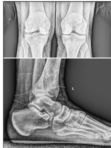
FIGURE 1: Plain bilateral knee and left ankle radiographs.

AVN of the bone is one of the leading causes of morbidity and disability in SLE patients. 2 AVN has been reported in 2-30% of patients with SLE. 8 Osteonecrosis (ON), is the cellular death of bone compo-