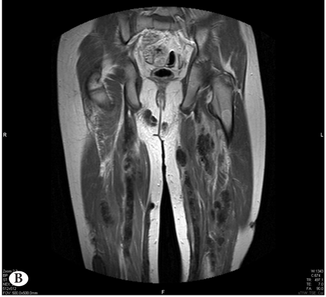
Figure 3. T1-weighted MR images showing HO in a patient with dermatomyositis as hypointense, A) axial plane B)coronal plane