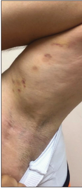
FIGURE 3: Ecchymotic areas seen following the rupture of one of the cords.

iopathic shoulder pain. Moreover, these cases emphasize the importance of inclusion of an examination of the axilla in those presenting with shoulder and arm pain; especially as patients are often unaware that they have developed a cord. 2