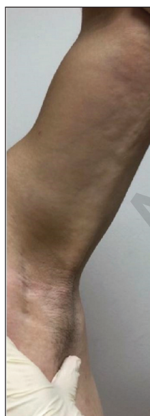
FIGURE 1: The axillary cord before treatment.

To date, AWS has mostly been associated with axillary lymphadenectomy or sentinel node biopsy performed as a part of breast surgery resulting in an interruption to lymphatic and vascular flow. 1,8 Idiopathic AWS has rarely been reported in the literature. 5,6 These cases highlight the importance of AWS being considered in the differential diagnosis of id-