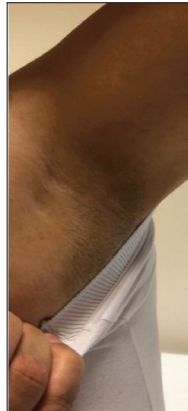
FIGURE 4: Resolution of cords following the course of physical therapy.

AWS is mostly seen following breast surgery but can also be seen in patients with no predisposing history or risk factors. This case highlights the need to consider a diagnosis of AWS in patients presenting with shoulder pain and reduced ROM, and the importance of a detailed shoulder examination to avoid misdiagnosis. Further studies on the optimum investigatory procedures and treatment of AWS are required to aid its timely management and avoid the development of chronic shoulder disability.