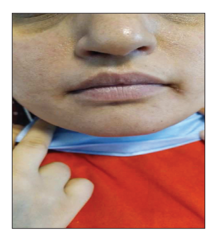
FIGURE 1: Angular cheilitis