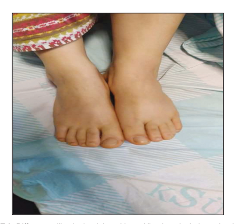
FIGURE 3: Diffuse swelling in the right ankle and livedo reticularis on the right toe.

chloroquine 200 mg bid (p.o) were started. aPL; anticardiolipin (aCL) immunoglobulin (Ig) G was 2.29 (0-12) and IgM were 3.71 (0-12) and anti- \beta 2-glycoprotein (a \beta 2GP) IgG was 1.15 (0-12) and IgM was